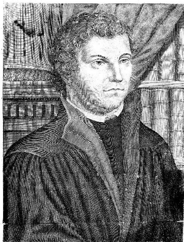
D. MARTINUS LUTHERUS. a Luca Cranachio pictus. A. 1526. Altenburg

As you might expect on this day of commemorating the Reformation, many of today's hymns come to us from the Reformer himself, a man especially gifted by God in his time to proclaim the truth of God's Word in word and song. Our Processional Hymn , A Mighty Fortress Is Our God , is Dr. Luther's best-known hymn, an iconic paraphrase of Psalm 46. The tune of A Mighty Fortress ("Ein Feste Burg") also serves as the basis for the chant tones heard in today's Gradual ; see if you can make it out.