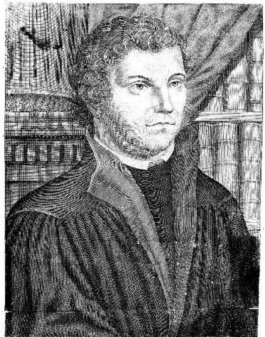
D. MARTINUS LUTHERUS. a Luca Cranachio pictus. A. 1526. Altenburg

As you might expect on this day of commemorating the Reformation, many of today's hymns come to us from the Reformer himself, a man especially gifted by God in his time to proclaim the truth of God's Word in word and song. Our Processional Hymn , A Mighty Fortress Is Our God , is Dr. Luther's best-known hymn, an iconic paraphrase of Psalm 46. The tune of A Mighty Fortress ("Ein Feste Burg") also serves as the basis for the chant tones heard in today's Gradual ; see if you can make it out.